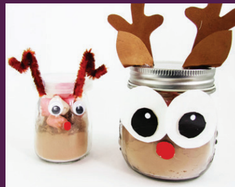
Jar Hot Chocolate