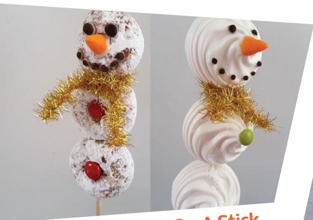
Snowman On A Stick

A staple part of Christmas is sharing food. These cute treats can be made easily and are great gifts or a fun snack to share.