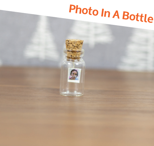
Photo In A Bottle

Instructions found at oscn.nz/files/photoblocks.pdf