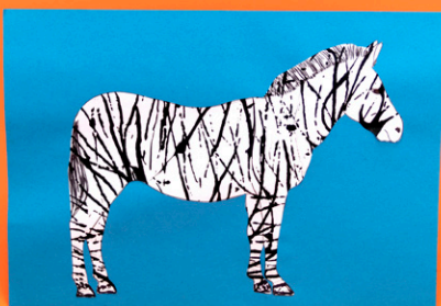
String Painted Zebra

Start with a horse, add some stripes and you get a Zebra. In this craft paint soaked string is placed over the image of a horse to create a beautiful arty creation.