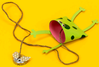
Bull Frog Catcher

The world has many amazing wild things to offer. These crafts are based on some of the wild things found around the globe.