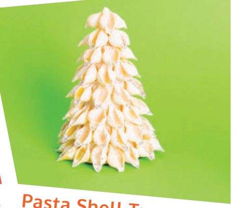
Pasta Shell Tree

Instructions found at oscn.nz/files/clearbaubles.pdf