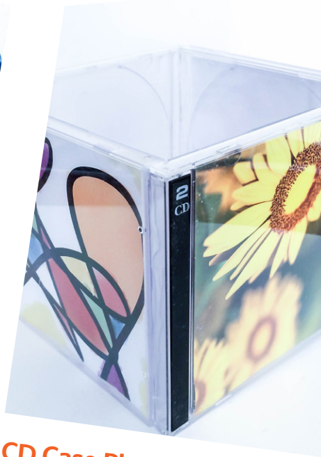
CD Case Photo Box

Hold onto your old felts, they can be reused along with an old CD and some glue to make an amazing spinning top. This craft is best suited to the larger felts but with a bit of hot glue you should be able to make it work with any size. Full instructions at oscn.org.nz/files/CDSpinningTop.pdf